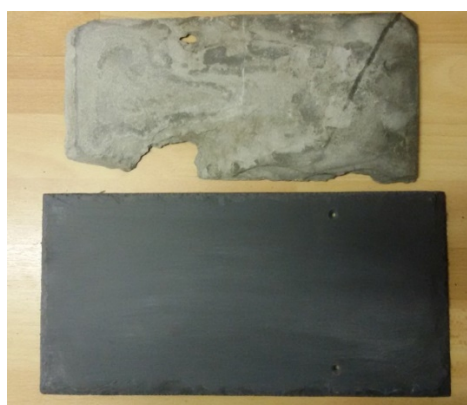
Slates old and new