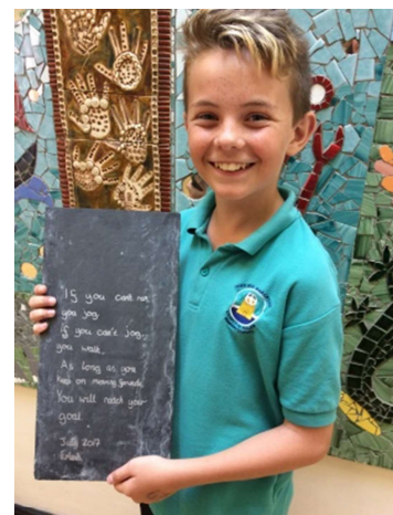
A pupil from Wick & Marcross Church in Wales Primary School has a message for the future